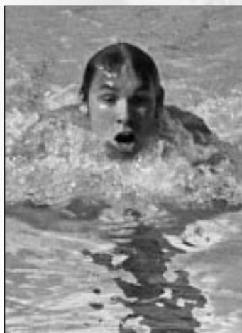
John Hencken was a five time medalist (3 golds) and a member of three Olympic teams.