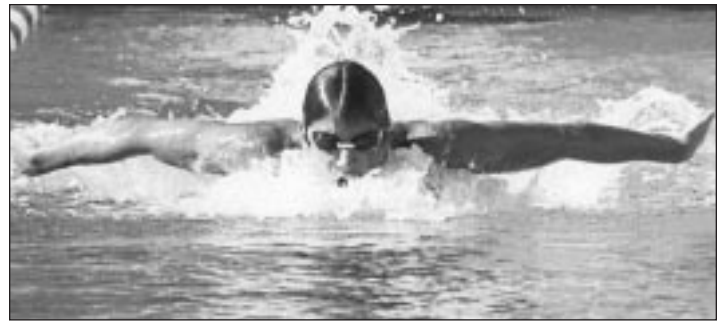
Pablo Morales won an NCAA-record 11 individual titles during his Stanford career.