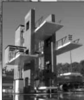
The Avery Aquatic Center is home to Stanford's Championship Aquatics Programs. Left: the Maas Diving Center includes a 10 meter tower flanked by one-meter and three-meter springboards.

The Sandy Foundation Team Room (men's) is located on the east side of the pool deck. The Harold A. Miller Team Room (women's) is located on the west side of the deck level. Both