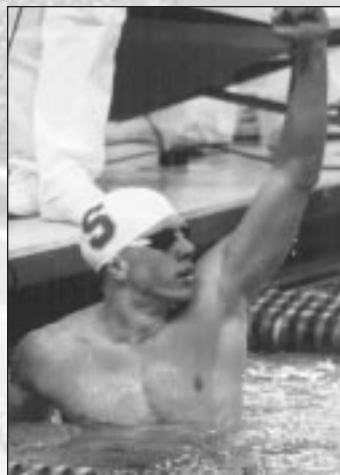
Kurt Grote was a gold medalist in the 400 medley relay in 1996.